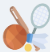
Recreational and sporting services