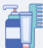
Appliances, articles and products for personal care