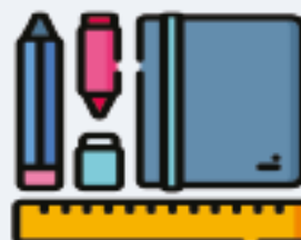
Books & stationery